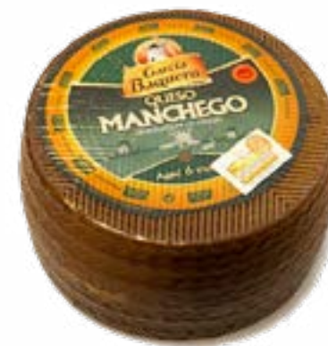
CHMANCCC | Manchego Garcia Curado 6 mths Approx. 3kg