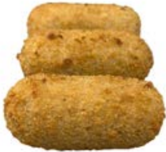
CROQBACC | Frozen Baccala Croquette 2kg Bag (Approx. 50g)