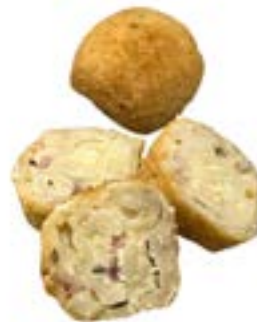
CROQSPAGCARB | Frozen Pasta Bite Croquette Spaghetti Carbonara 2kg Bag (Approx. 50g)