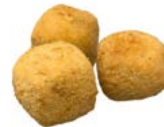
CROQSPAGWAGMOZ | Frozen Pasta Bite Croquette Spaghetti Wagyu Beef Bolognese & Mozzarella 2kg Bag (Approx. 50g)