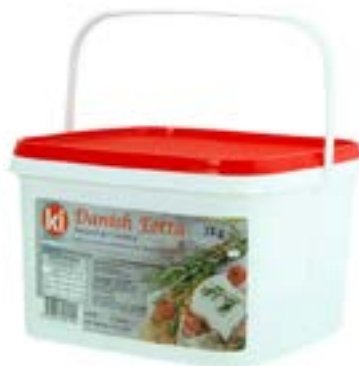
CHDFET4KG | Danish White Fetta 2kg (4/ctn)