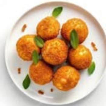
ARANCINI4 | Arancini Truffle & Porcini 1.5kg (50x30g)