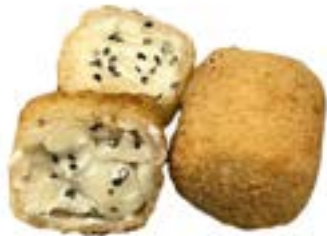
CROQSPAGCAC | Frozen Pasta Bite Croquette Spaghetti Cacio e Pepe 2kg Bag (Approx. 50g)