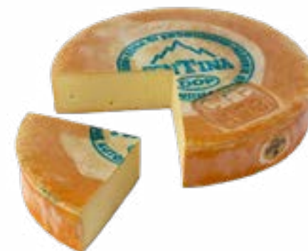
CHFONTINA | Fontina Aosta DOP Cheese Approx. 2kg