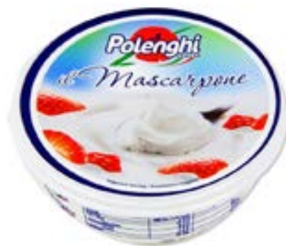
CHMASC15 | Polenghi Mascarpone 500g (6/ctn)