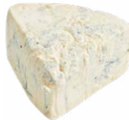
CHGORGFR | S. Antonio Gorgonzola Approx. 1.5kg