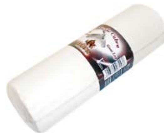
CHGOATS | Spanish Spreadable Goat Cheese Le Sacre Coeur 1kg Log