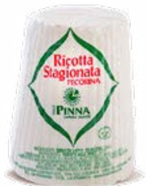
CHPECSARDO | Pinna Italian Ricotta Salata Sheep Milk Approx. 300g