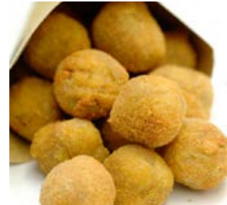
OLACORSA | Olive Ascolana Classica 2kg