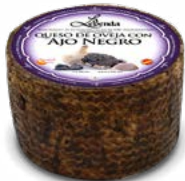
CHMANBG | Manchego Spanish Sheep with Black Garlic Approx. 3kg