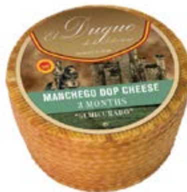
CHMANC | Manchego Gran Maestro 3 mths Approx. 3kg