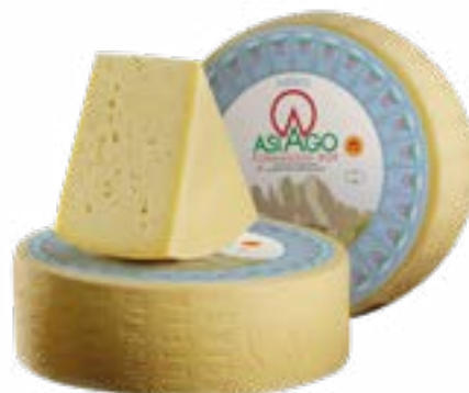
CHASIAGO | Asiago Pressato DOP Cheese Approx. 3.2kg